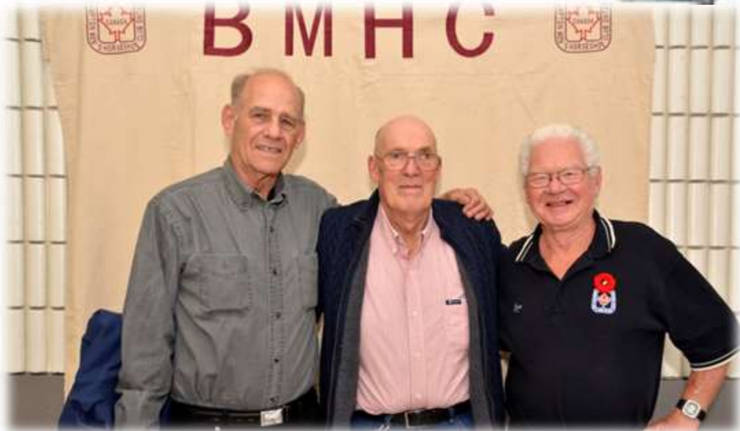
Receiving their Hoodies with the Iron Man Crest on the sleeve at the Awards/Banquet Nov. 4, 2017