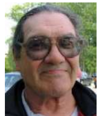
2014 Gary Johnson